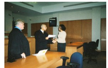
CASAs Receive their court appointments. More pictures on our website