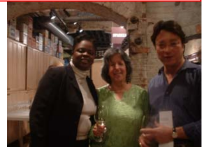
Staff pose for picture

CASA of Baltimore would like to thank everyone who bought tickets to the event and participated in the silent auction and/or made donations to CASA.