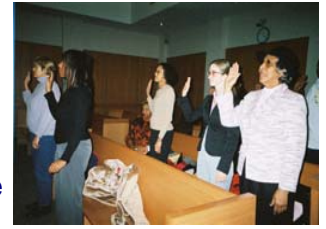
Swearing In of New Volunteers