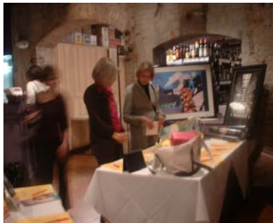
Shopping at the silent auction

CASA Baltimore held its fourth annual exciting and successful fundraising event, the Here's to Helping Children, Wine-tasting and Silent Auction. This year's event was the biggest and the best so far!