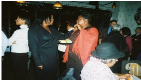
Volunteers, Staff and Board Members enjoying the festivities

Additional pictures posted at our website.