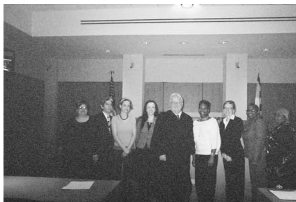
New CASA volunteers with Judge Hargadon

CASA Baltimore welcomes the following new CASA volunteers: