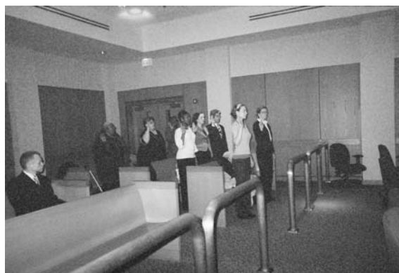
CASAs receive their court appointments

This newsletter is published four times a year by CASA Baltimore. CASA Baltimore is a 501-3 C non profit organization advocating for foster children in Baltimore City. All contributions are tax deductible. If you'd like to know more about how you can get involved, please contact us by calling 410-244-1465 or visiting our website: www.casabalt.org . No portion of this newsletter can be used or reproduced without consent.